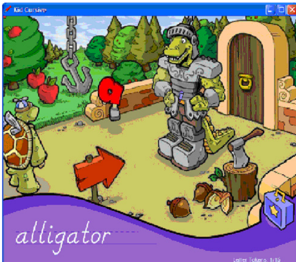
FIGURE 1 STUDENT SCREEN LAYOUT.

for remainder of the system (including the user interaction and intelligent tutoring modules).